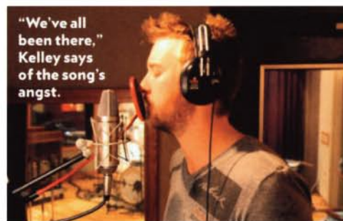
"We've all been there," Kelley says of the song's angst.

LYRICAL LESSON: "My favorite line is 'I guess I'd rather hurt than feel nothing at all,'" says Kelley. "It's so true. We had that conversation with Hillary, and I told her, 'The fact that you loved so strong that it hurt means a lot.'"